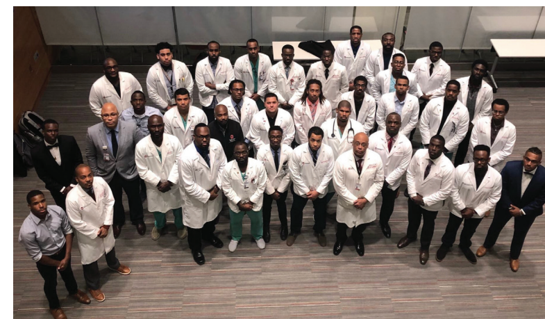
The African American Male Mentoring Roundtable brings together black male attending physicians, medical students and premed students in a regularly recurring dinner meeting intended to inspire and mentor young men in the profession.

One of the PACT programs, the Health Sciences Academies (HSA) , addresses the shortage of physicians serving underrepresented communities by encouraging students residing in these communities to consider a career in medicine. The HSA aims to increase the academic performance of students who reside on the near east side of Columbus, as well as to increase student interest and achievement in the health sciences or other occupations within the healthcare industries (e.g., office/clerical, marketing and community relations). The program serves students at East High, Champion Middle, Beatty Park, East Columbus, Eastgate, Ohio Avenue and Trevitt Elementary schools by developing pathways to careers that provide services to residents of the PACT neighborhood.