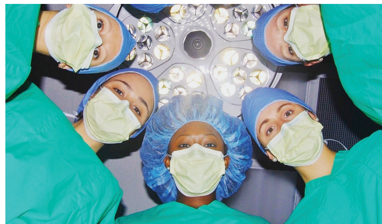
Ohio State female medical students on their surgery rotation.

La Clinica Latina is a free, full-service health clinic for Spanish-speaking individuals. It provides ongoing health care, including gynecological care, for women. The Asian Health Initiative Free Clinic serves the needs of the Asian community through ongoing health care. The Physicians Care Connection Free Clinic , an affiliated organization of the Columbus Medical