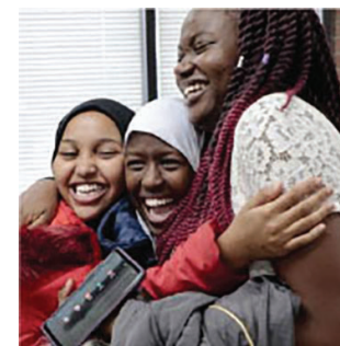
Ohio State student organization SHINE brings health education classes to grade-school Somali students at Focus Learning North Academy in Columbus.

Ohio State sponsors more than 100 medical student groups, offering its members numerous educational, social and volunteer opportunities. Organizations such as the Network of Underrepresented Residents and Fellows (NURF), the Ohio State chapter of the Student National Medical Association (SNMA), the Ohio Chapter of the Latino Medical Student Association, Aprovechando Salud y Educación (Embracing Health and Education), and the Asian Pacific American Medical Student Association assist communities by providing medical education and health screenings. The Office for Diversity and Inclusion provides support to these and other URM groups, including co-sponsoring SNMA’s annual Making It to Medical School 101 pre-med conference and Rising Up Strong summer program. For a list of medical student organizations, visit medicine.osu.edu/students/life/organizations/pages/index.aspx .