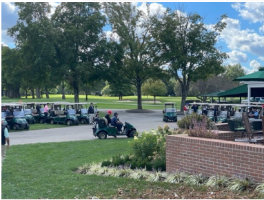
4th Annual Islet Cell Invitational

BENEFITING OHIO STATE UNIVERSITY WEXNER MEDICAL CENTER'S DIABETES AND METABOLISM RESEARCH CENTER