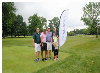
3rd Annual Islet Cell Invitational