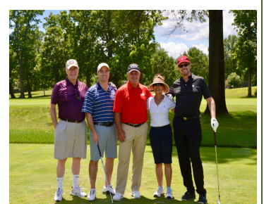
1st Annual Islet Cell Invitational

Join doctors, athletes, golf pros, TV anchors, and other prominent members of our community for a day of fun and relaxation!