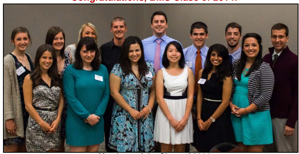
Members of the Class of 2014 (hometown and post-graduation pursuits)