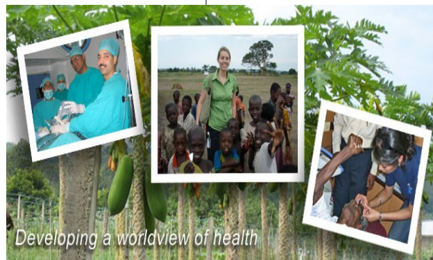
Developing a worldview of health