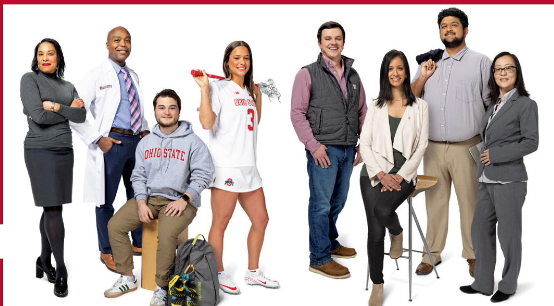
Cover of the Spring 2025 Ohio State Alumni Magazine