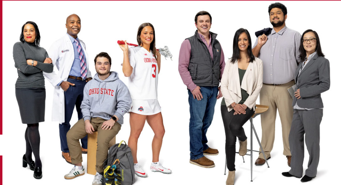
Cover of the Spring 2025 Ohio State Alumni Magazine

473 West 12th Avenue Columbus, OH 43210 www. https://medicine.osu.edu/departments/davis-heart-lung-research-institute