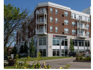
Worthington Family Medicine