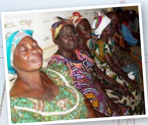
A group of Ghana patients waiting to be seen in the clinic