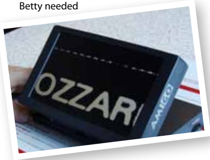
BEFORE K-PRO: Magnification level Betty needed