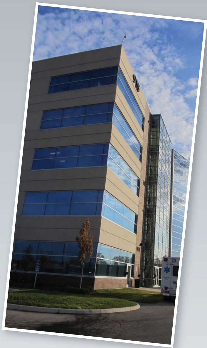
OSU Eye & Ear Institute: Havener Eye Institute - Main Location