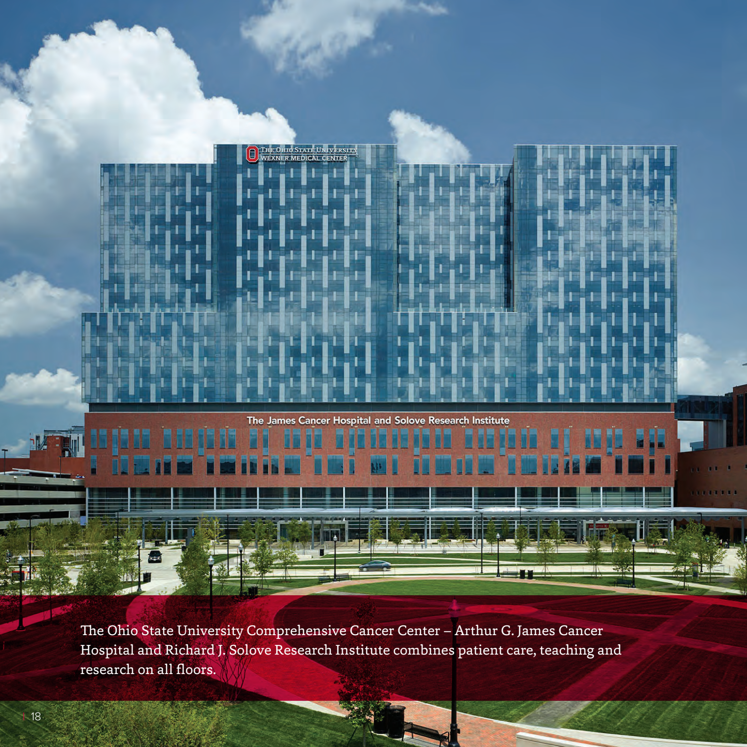
The Ohio State University Comprehensive Cancer Center – Arthur G. James Cancer Hospital and Richard J. Solove Research Institute combines patient care, teaching and research on all floors.