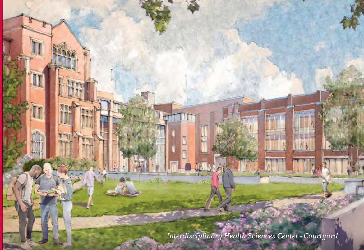
Interdisciplinary Health Sciences Center - Courtyard