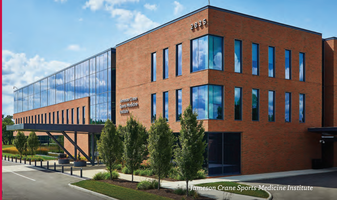
Jameson Crane Sports Medicine Institute