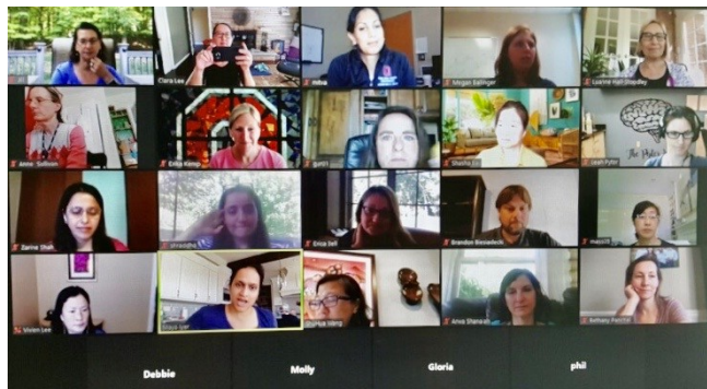
WIMS steering committee zoom meeting 8/2020

Wonderful, Incredible, Magnificent and Strong!!