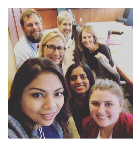
WIMS Data Committee