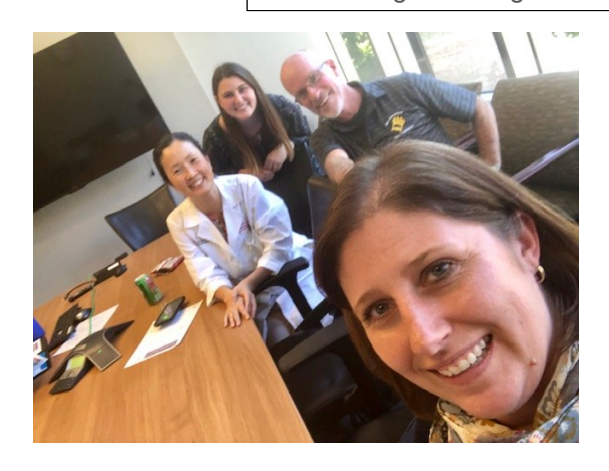
WIMS Media Committee

The upcoming AAMC Early Career Women Faculty Leadership Development Seminar (EWIMS) July 11-14, 2020 in Minneapolis, Minnesota. The application process will open in mid-February. For more information click here: https://www.aamc.org/professional-development/leadership-development/ewims